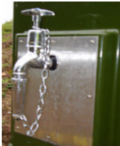
Figure 5 Example of a Harris type tap

All service reservoir compartments should be fitted with individual sampling taps in order that the microbiological quality of water within each compartment can be determined.