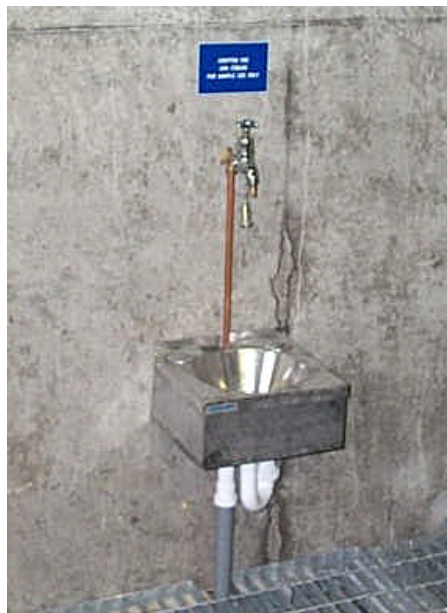
Figure 1 Example of a labelled fixed sampling point

The location of the sampling point should always be identified in sufficient detail to enable a repeat sample to be taken from the same place. Fixed sample points, see Figure 1, such as those at treatment works and service reservoirs, should have a permanent notice or label attached to them, or in proximity to them, indicating for example, the exact location of the tap and possible reasons for its use and the nature or type of the water being sampled. Other details that may be useful to sampling staff might include information on the time required to adequately flush water to waste before sampling.