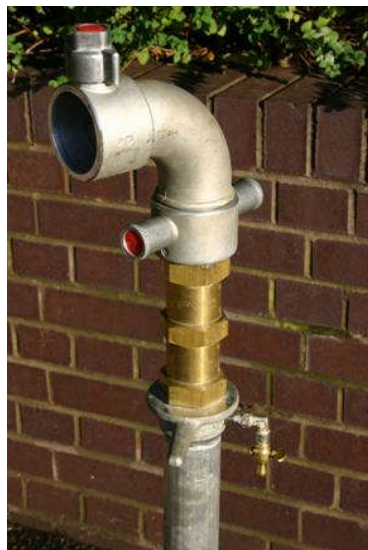
Figure 7 Example of a combination standpipe

Different types of standpipes are available. A two-inch standpipe is generally used for flushing, and a bib tap half-inch standpipe (with a permanently attached tap) is used for sampling. Alternatively, a 'combination' standpipe, see Figure 7, can be used. This comprises a two-inch standpipe with a side tap, which can be used for direct sampling after an appropriate period of flushing. Standpipes with non-return valves may harbour a build up of debris and/or biofilm, and sampling downstream of such valves may give rise to samples that are not representative of the water being sampled. A combination standpipe (where the tap is upstream of the non-return valve) may be more suitable.