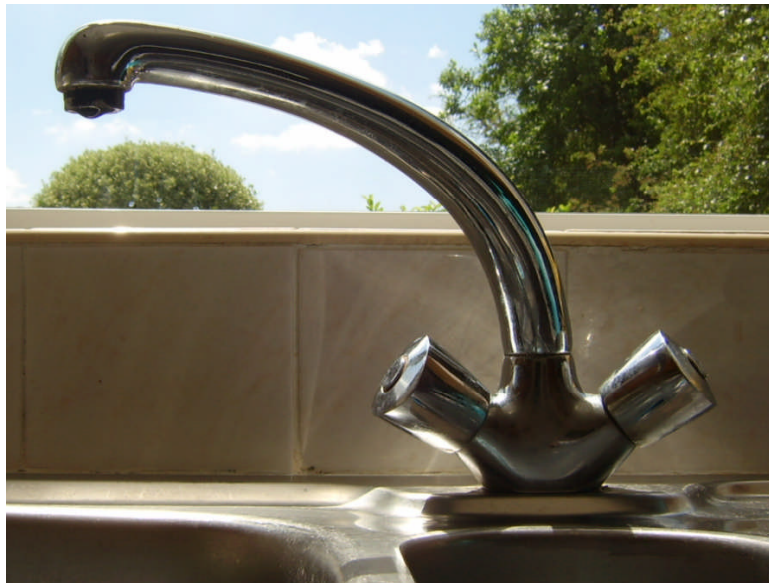
Figure 6 Example of a mixer tap

The procedures used to disinfect taps will depend on the type of tap to be sampled. Certain taps may contain anti-splash devices or may be made of materials which render them difficult, or impractical, to disinfect. Ideally, sample taps should be clean, free from extraneous matter such as slime, grease, cleansing or disinfecting agents and attachments which might affect the microbiological quality of the water being sampled. Taps that leak between the spindle and the gland when the tap is turned on should not be used. Uni-flow and other mixer taps, see Figure 6, where the hot and cold water mix together within or at the spout of the tap might not provide a representative sample of the cold water supply. In these cases, guidance should be sought as to the most appropriate procedure to be used for disinfecting these types of taps. See section 5.2.