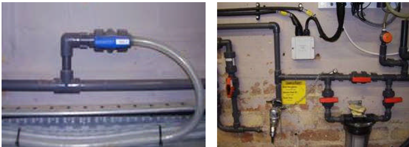
Figure 3 Examples of incorrect tap locations (dedicated supply not provided)

Sampling points at water treatment works should be fitted with appropriate metal sampling taps which conform to national standards (16) . These taps should not be fitted with attachments or inserts, and should be clean, free from extraneous matter, for example slime, grease, cleansing or disinfection agents, which may affect the microbiological quality of the water being sampled. The neck section of swan neck taps can harbour biofilm growth. Hence, appropriate cleaning (for example, disinfection and/or flame sterilisation) should be considered in order to ensure potential biofilm growth does not impact on samples when these types of taps are used. Plastic or mixer taps are not suitable for sampling water required for microbiological analysis at water treatment works. Sample taps should be provided on each outlet main of the water treatment works and be adequately labelled with, for example the location and required flushing time (if appropriate). Sample taps may be left continuously running. Microbiological samples may be taken from such taps without