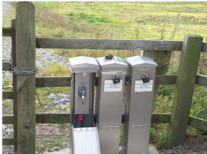
Figure 4 Example of a lockable sample cabinet

The actual tap may be for example a “Harris” type tap, see Figure 5. This type of tap is made of a chrome plated gun metal construction, possessing a tapered spout. When not in use the spout is kept clean and further protected by a cover. To prevent its loss or misplacement, this cover is secured to the tap with a chain.